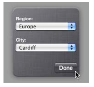
Figure 2. Mac OS Dashboard widget (a) front – UI (b) back– metaUI