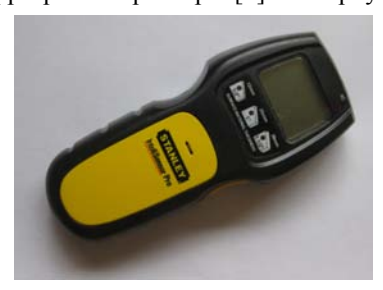
Figure 3. Wall Stud Detector

A similar approach is to use some form of external 'tool' for meta-level modifications. This happens in the real world; Figure 3 shows a stud detector, which detects the wooden studs in a wall so that you can screw into them. The wooden structure is hidden behind plasterboard and wallpaper, but the stud detector reveals it – the "provide visibility" appropriation principle [9] in the physical world.